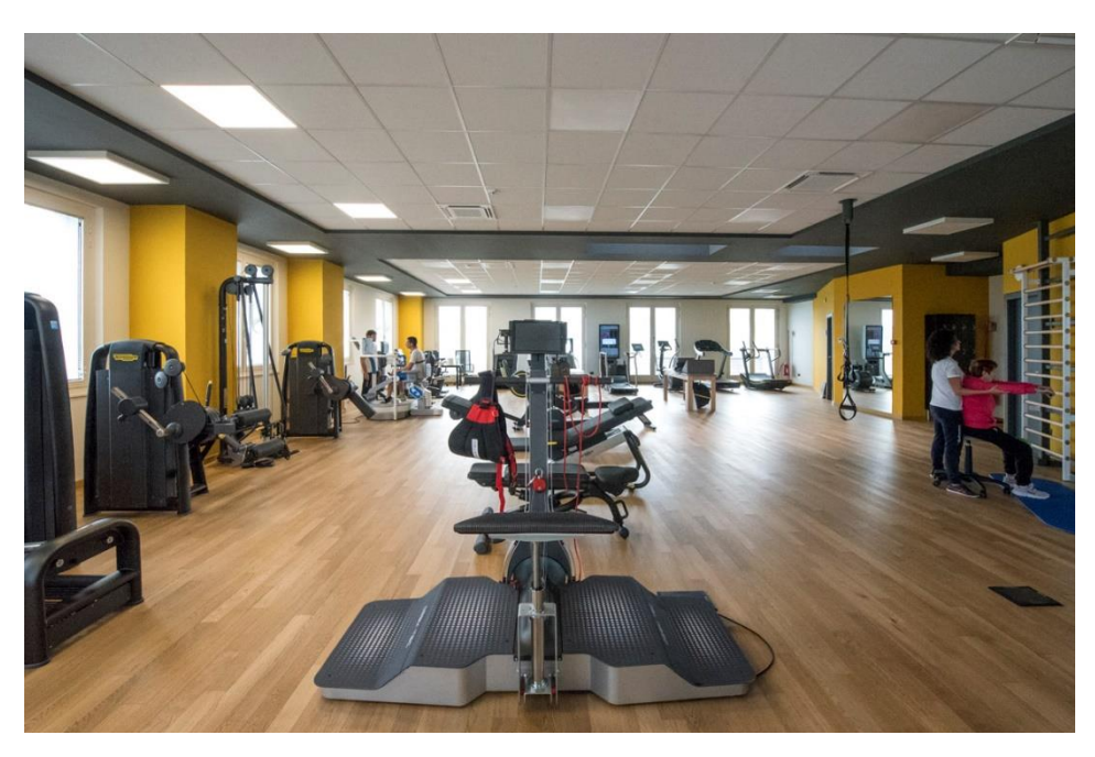
Figure 2. Gym of the Center for Physical and Rehabilitation Medicine "Sport and Anatomy".